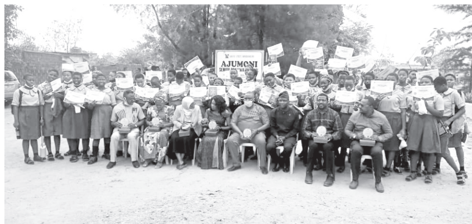
Some of the mentees; students of Ajumoni Senior Grammar School, displaying their certificates in a group picture with the leadership of U S International Visitor Leadership program (IVLP)

He said: "When some of my friends told me to join them in smoking and get involved in internet fraud - Yahoo Yahoo, I made them understand that it is not good and that there is no future in it. I advised them to turn a new leaf and try to make a better future for themselves. I will like to further advise them to