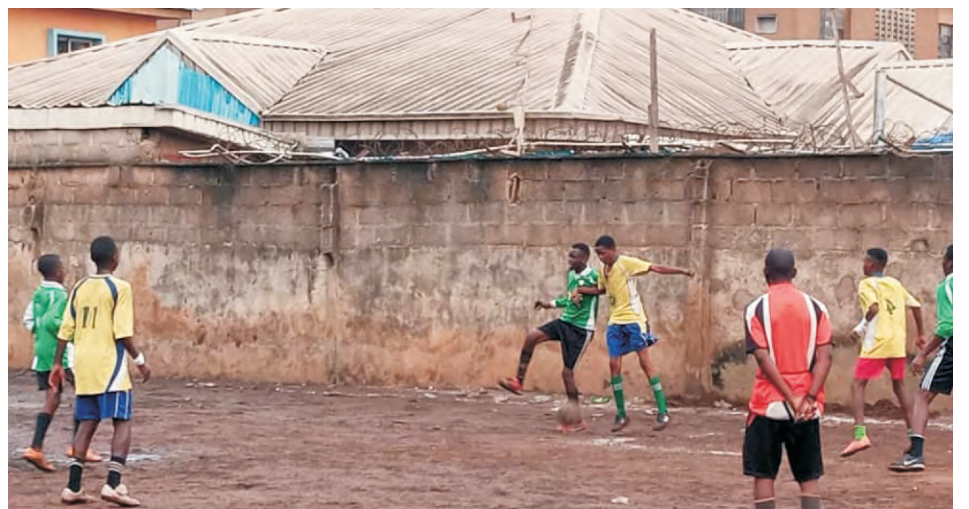
Alpha FC vs Ibadan FC

Alpha FA defensive blunder caused the 3rd goal to be